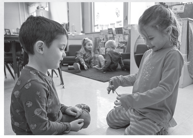
BKW's UPK program encourages positive relationship-building and introduces new ways for students to begin their pathway in a hands-on learning environment.

By accessing a Universal Pre-K program, students can work on their