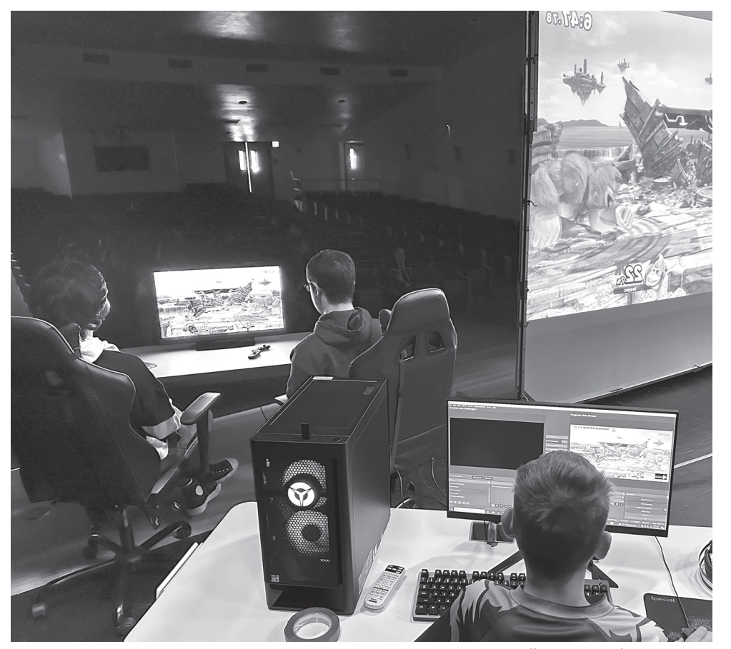
Mentors create opportunities to help others become better. At BKW, that effort extends from grade to grade.

In general, statistical data shows the merits of mentoring - whether from an adult to student or peer-to-peer - and the benefits that come from success in school work. The benefits range from better grades, communication on obstacles or stress in school, and opportunities to reach their desired pathways.