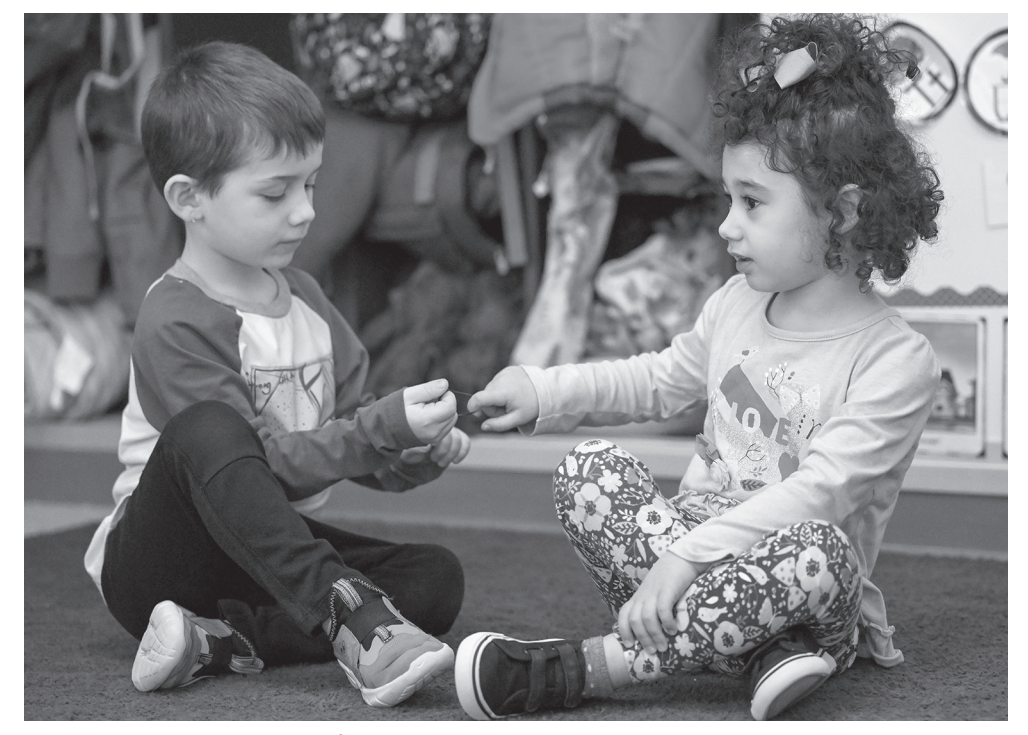
It's never too early to meet new friends and begin your learning journey.

earliest skill sets to encourage their progress before entering kindergarten and beyond. Universal Pre-K programs provide access to resources and instruction to prepare them for learning in today's classroom with high-quality opportunities to learn and grow.