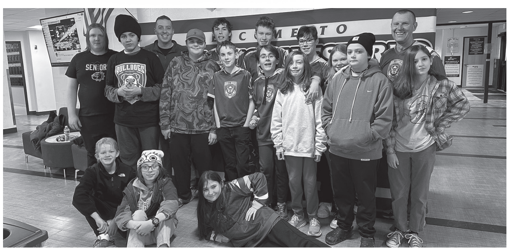
No matter the grade level, students are recognized for doing their best and giving their all.

To receive an application, contact the District Clerk Anne Farnam at (518) 872-1293 ext. 5133. If you would like a ballot mailed to you, your application must be received by 5 p.m. on May 14, 2024. If you plan to pick up your ballot, your application must be received by 5 p.m. on May 20, 2024. The completed ballot must be received by 5 p.m. on May 21, 2024.