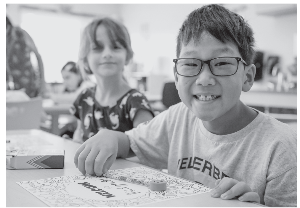
At BKW, our students are eager to learn and be the best Bulldog they can be!

Also on the ballot: See pg. 8 for a list of propositions.